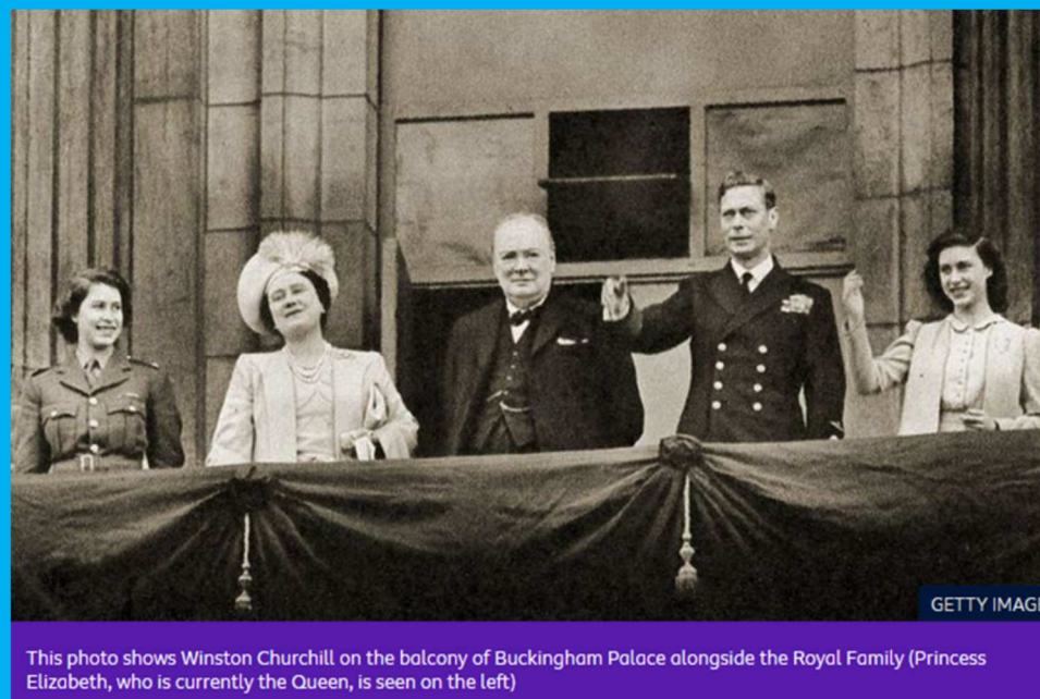
This photo shows Winston Churchill on the balcony of Buckingham Palace alongside the Royal Family (Princess Elizabeth, who is currently the Queen, is seen on the left)

Tuesday 8 May, 1945, was the official end of World War II in Europe. Huge crowds - with lots of people dressed in red, white and blue - gathered outside Buckingham Palace in London. They cheered as King George VI and his family, including Princess Elizabeth (the current queen) and Princess Margaret, came out onto the balcony to greet everybody. Princess Elizabeth and her sister were allowed to leave the palace and celebrate with crowds outside, although they had to do it secretly. The future Queen described it as "one of the most memorable nights of my life".